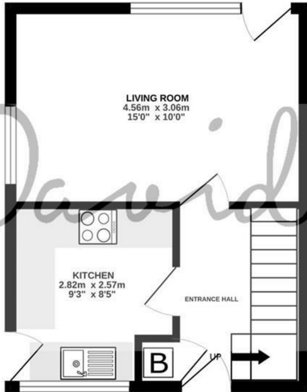
GROUND FLOOR 26.8 sq.m. (288 sq.ft.) approx.